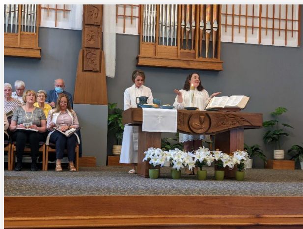
Easter Sunday Worship