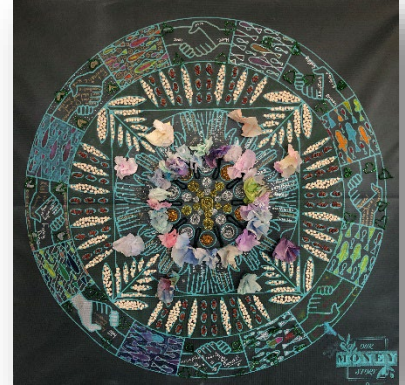
Our Money Story (from A Sanctified Art)

The Finance Team participated in the Stewardship drive and conducted follow-up to ensure that everyone had an opportunity to complete a pledge as we move forward into 2023. The Team crafts a budget based upon many factors and makes adjustments to committee and team requests to formulate a budget proposal for the upcoming year.