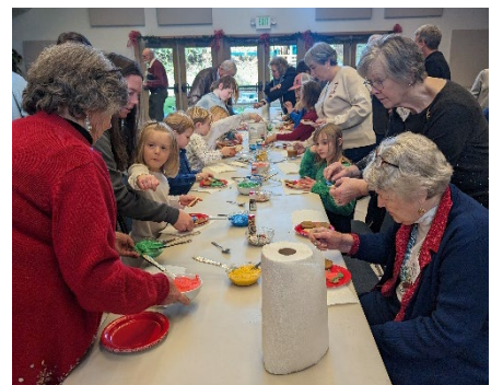
Cookie Decorating December 10