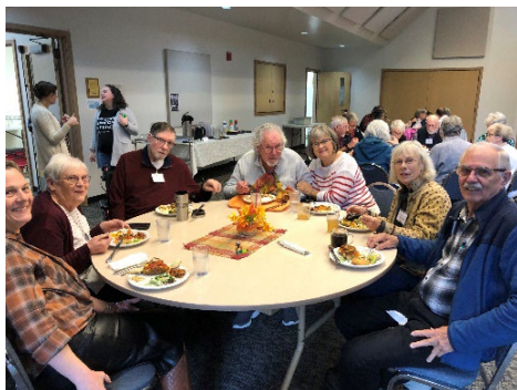
Celebration Sunday Potato Potluck November 19