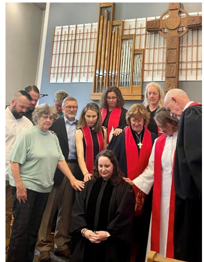
Laying on of hands at my ordination service June 22

I want to thank my Summit family for all your support and encouragement as I transitioned into the new role serving as pastor of Hagar's Community Church. Many of you have reached out to ask how things are going, and have told me you're praying for me and cheering me on. What a gift to know I have such a supportive and encouraging home church.