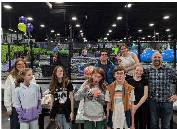
Youth outing to Defy in Silverdale