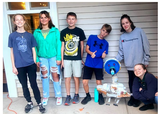
"Terry" the Albatross made from plastic collected in worship