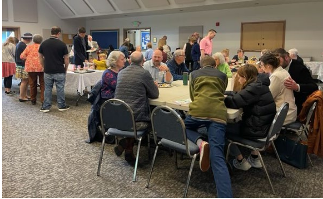
Easter Brunch April 9