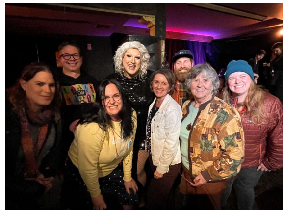
Thursday Night "UnClobber" group at a Flamy Grant show in Seattle