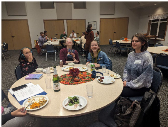
Third Friday Suppers