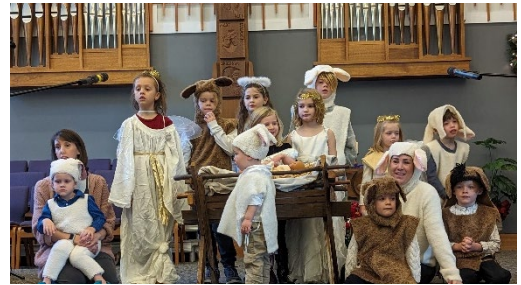
"God Chose to Be a Child" Christmas Pageant December 10