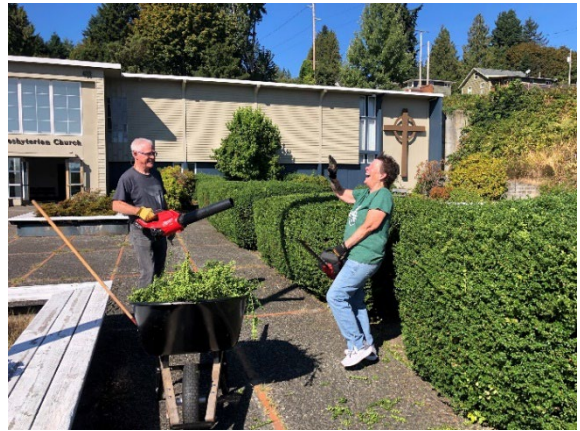
Having fun at the June work party

After years of trouble with our HVAC units in the choir room and fellowship hall, we collected bids on replacing them with more energy efficient systems. Session approved adding a special request to the pledge cards for 2024 to build up the Capital Projects Savings account.