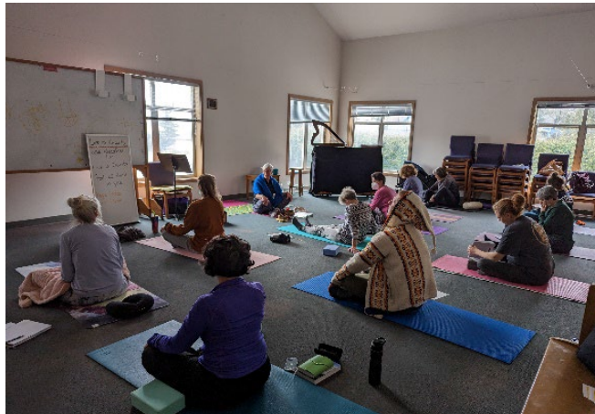
Lent Yoga Retreat